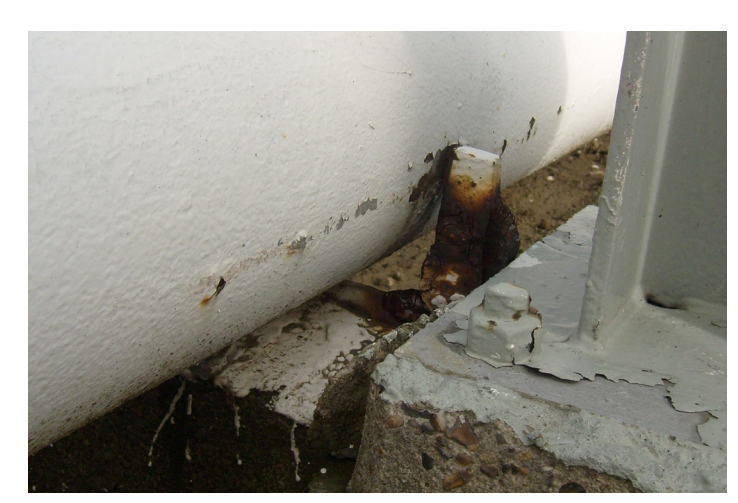
A close up view of a corrosion under a simple support located by interpreting the guided wave test results.