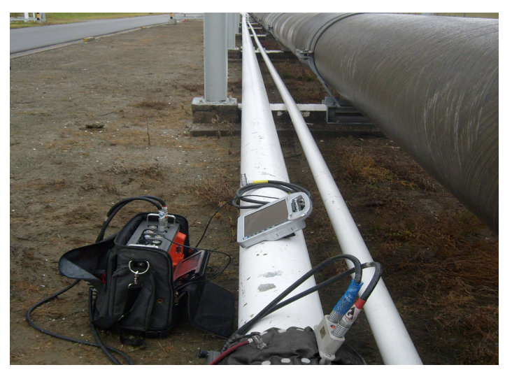
An overview of the 8" pipe under inspection.