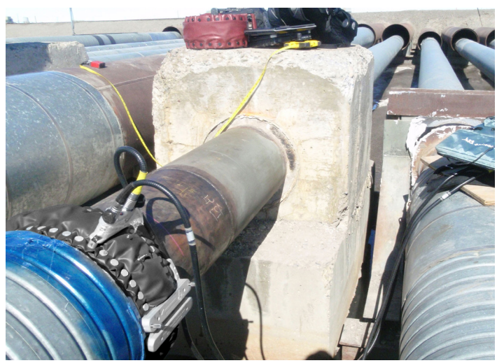
Guided wave testing of concrete anchor location on a 16" oil line using a HD inflatable ring.