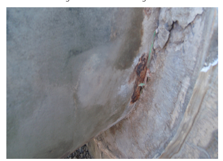
A corrosion patch found at the interface location.