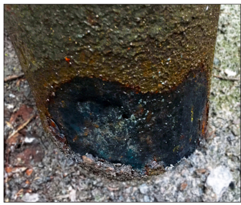
Indication A1. A through-wall defect located on the section just above the ground interface of the lamp post.

Following the removal of the galvanised coating, a detailed visual inspection found a corrosion patch near the ground interface with the most severe location corresponding to a through wall defect. As a result of the GWT findings, the inspector was able to inform the authority for immediate action.