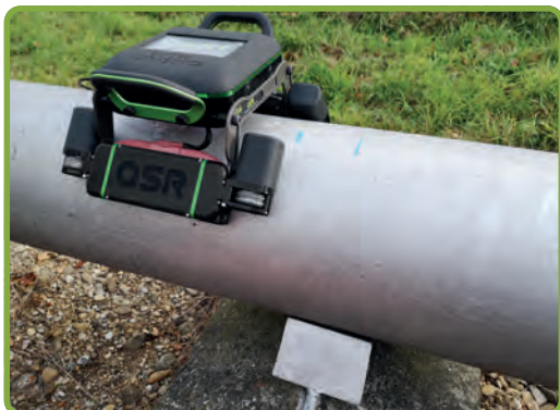
Scanning for CUPS with QSR1®