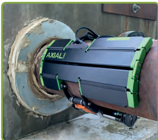
Scanning an embedded support with QSR® Axial