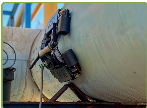
Scanning for CUPS on a 36" pipe with QSR® ALF