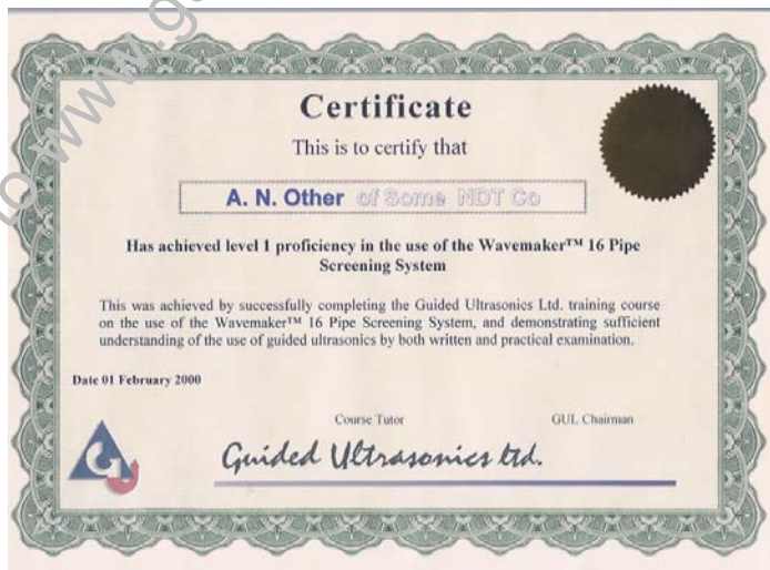
Fig. 2 (normal size A4)