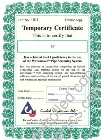
Fig.1 (normal size A5)